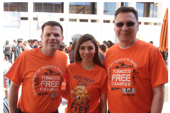
Photo courtesy, for more information about UTEP Tobacco Free Campus visit https://www.utep.edu/tobaccofree/

►► Note: Smoking is not allowed on campus, any use of tobacco is prohibited.